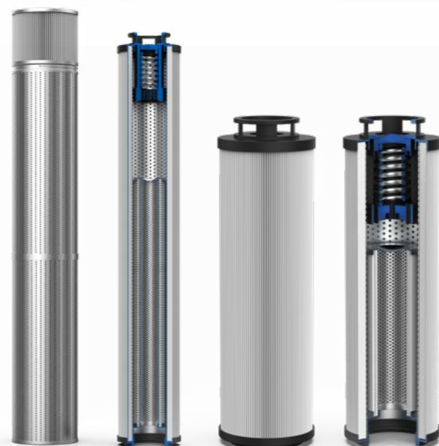
DOUBLE AND TRIPLE STAGE